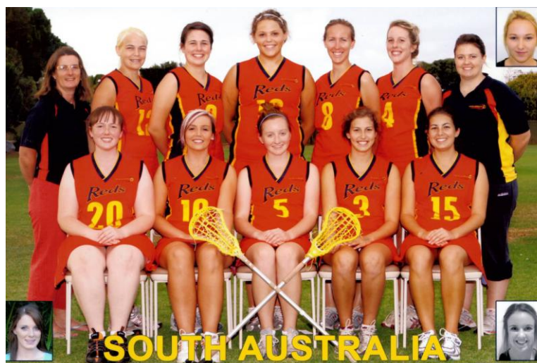
South Australia – Champions