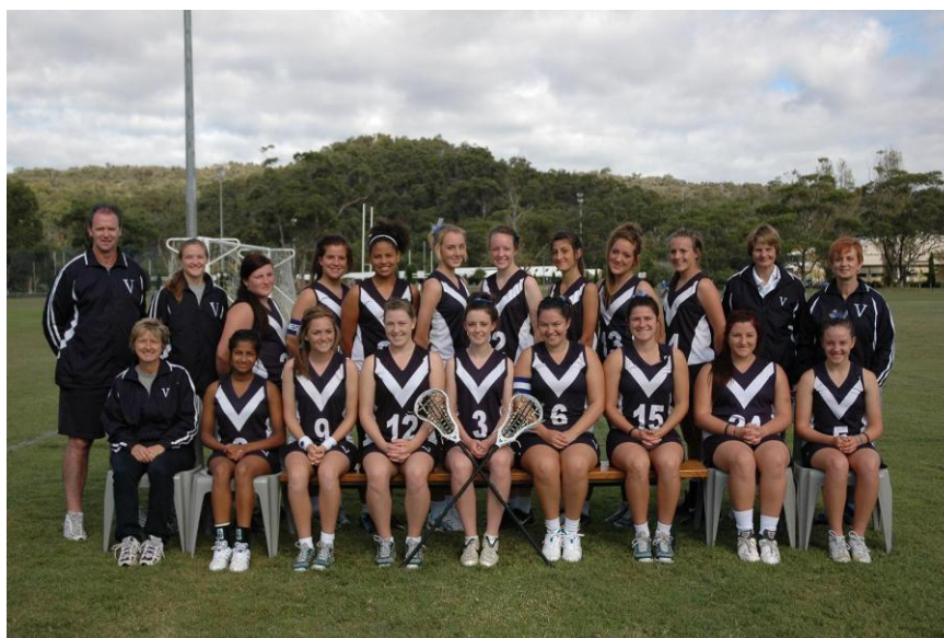
Victoria – Champions