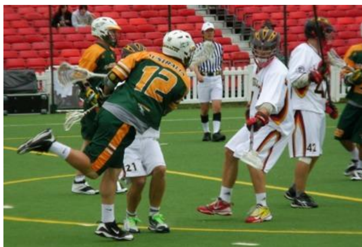
Australia v Germany, FIL Men’s World Championship

The Australian Senior Men’s team defeated Japan for the bronze medal, maintaining its ranking as the third best men’s team in the world. The team comprised 5 players with past world game experience and 18 new comers, with all players acquitting themselves to the demands of playing consecutive days, and bonding extremely well.