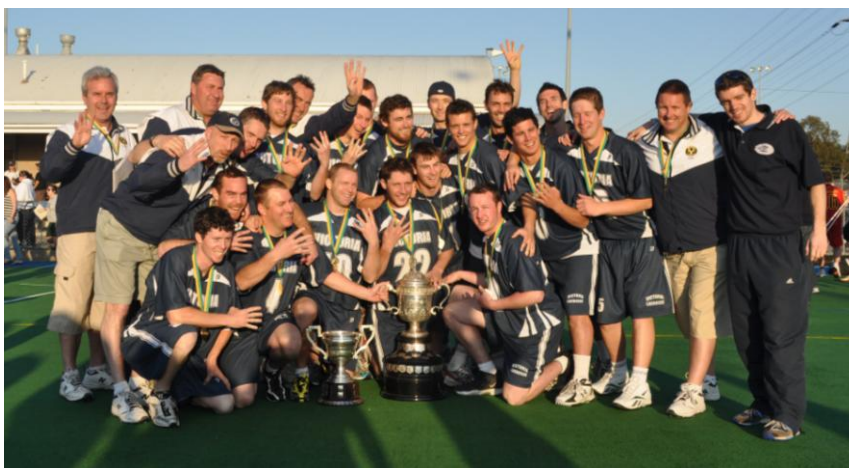
Victoria – Champions