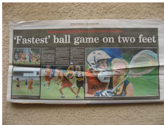
Article from the U17 and U21 National Championships, Sydney, April

The senior members also need to take a more active role in the game in order for it to grow.