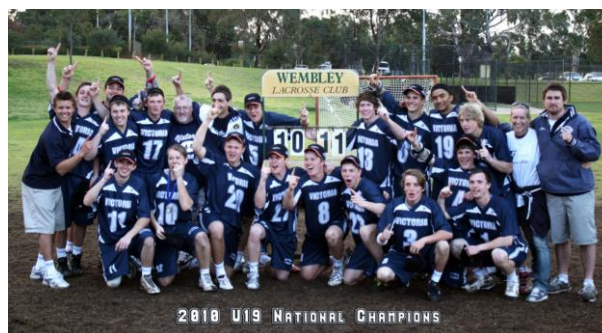
Victoria – Champions