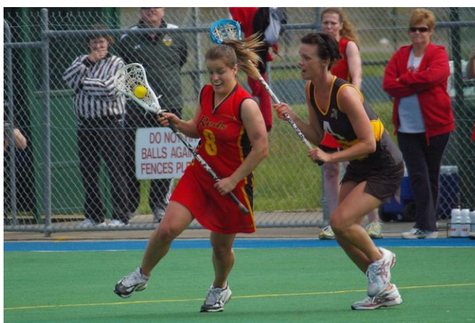
South Australia v Western Australia, Gold Medal game - Senior Women's National Championship