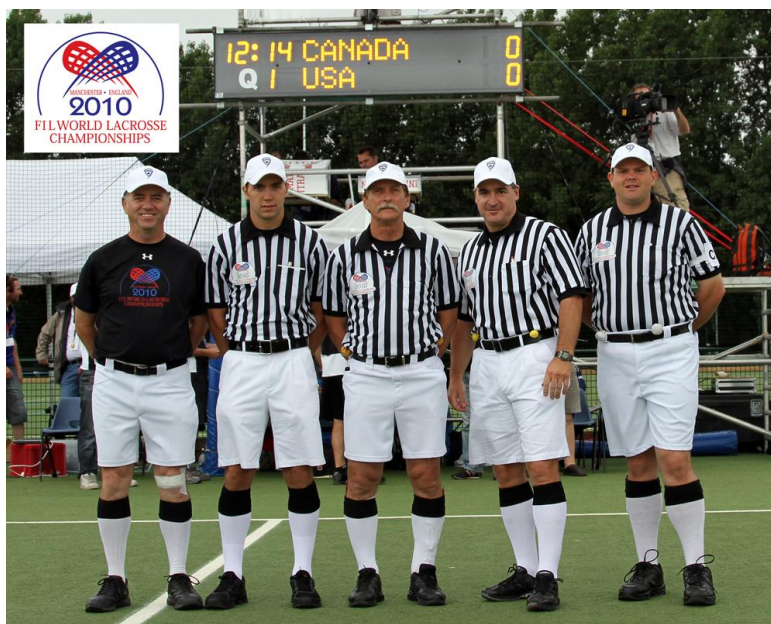
Gold medal match officials