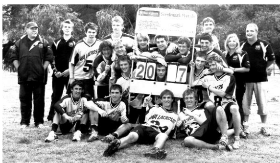
WA – Champions