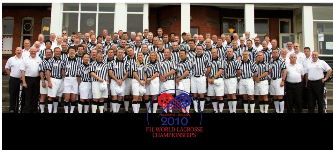
FIL 2010 Men's World Championship Officials