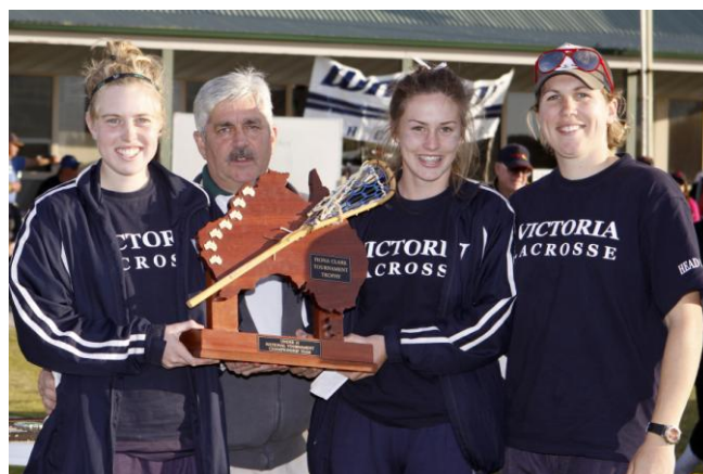
U15 Girl's National Champions, Victoria, with the Fiona Clark U15 Girl's National Tournament Trophy

Looking to the future it is clear that the ALA, and Australian lacrosse as a whole, continues to find itself at a challenging but exciting period in its history. The past few years have been a time of profound change, which has seen those who are truly committed to a joint National Governing Body survive and move forwards. As I complete my first two years as President/Chairperson know that I have been pleased to serve the sport, and I wish the incoming Board much success in the coming year.