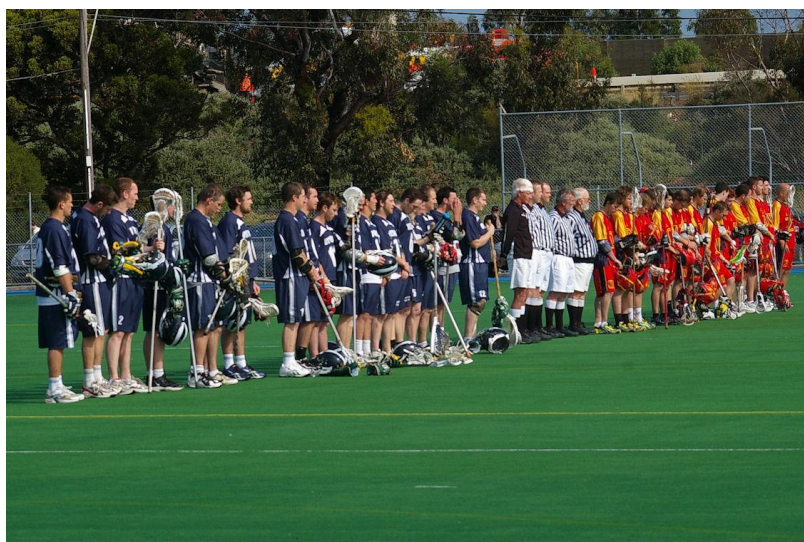
Victoria v South Australia – Gold Medal game, Senior Men's National Championship

I would like to thank fellow board members for their support and the time and effort contributed to make the inroads into national lacrosse development.