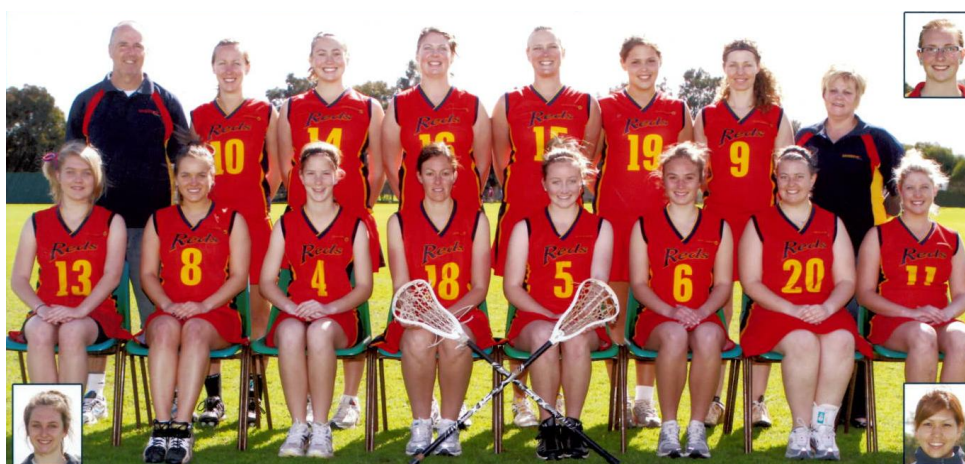
South Australia – Champions